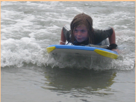
Faith Loving the OB Waves