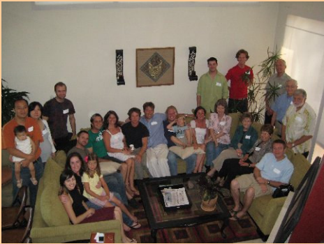
Launch Team in Late May